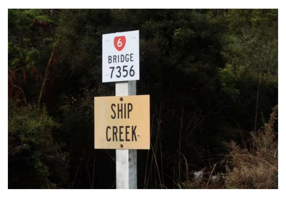
Yep! Up Ship Creek really does exist!!!