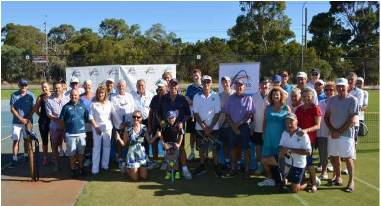
Opening of new Court Hire System!