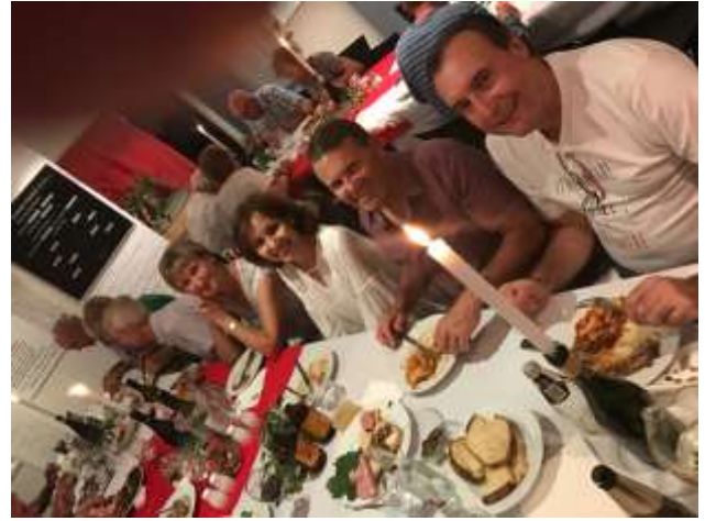
Midweek end of year pennant dinner!